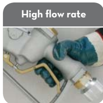
High flow rate